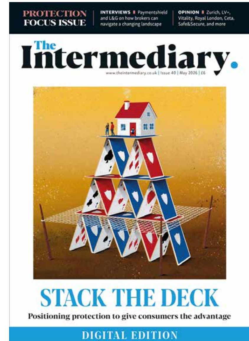
The Intermediary Insurance - Stack the deck